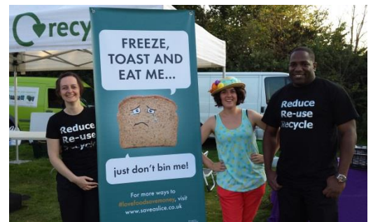
The Waste Minimisation Team

What we do really is great fun and interesting, so please do get in touch today.